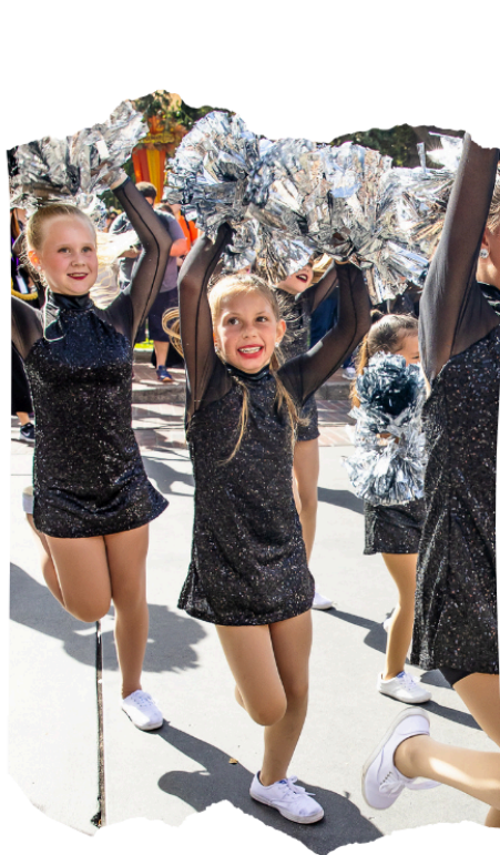
DISNEYLAND OCT 19, 2025 REGISTRATION DEADLINE IS AUGUST 8 , 2025