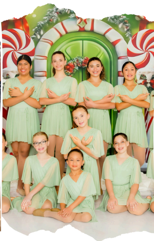
WINTER RECITAL DEC 13, 2025 REGISTRATION DEADLINE SEPT 30, 2025