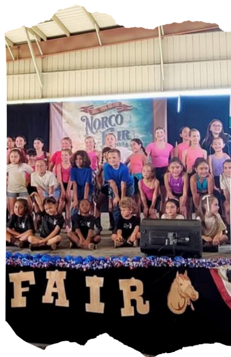
NORCO FAIR AUG 30, 2025 REGISTRATION DEADLINE IS AUG 15, 2025